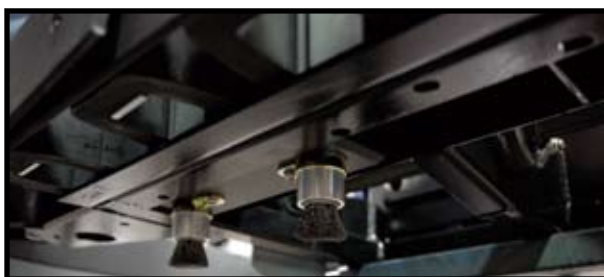
J&J's self cleaning charge pickup promises to revolutionize the industry!