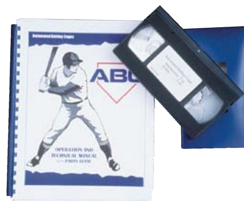
ABC Manual & Training Video